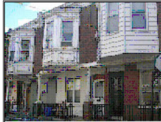
Philadelphia Forward's interactive web-based resource uses example city homes to illustrate Real Estate Taxation issues

This tool uses example homes in each council district to illustrate unfairness in city Real Estate Taxation and show how full-value reassessment and other proposed policies — reducing the Real Estate Tax rate, using a “buffering” system to prevent dramatic increases in tax bills, and taxing land more