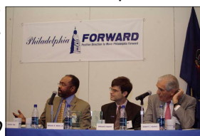
FORWARD THINKER awardees make points as part of the panel discussion

The awardees took part in a discussion focused on the state of reform in Philadelphia and making change in a city not eager to depart from the status quo . For event photos, a transcript of the panel discussion, and video highlights, visit: